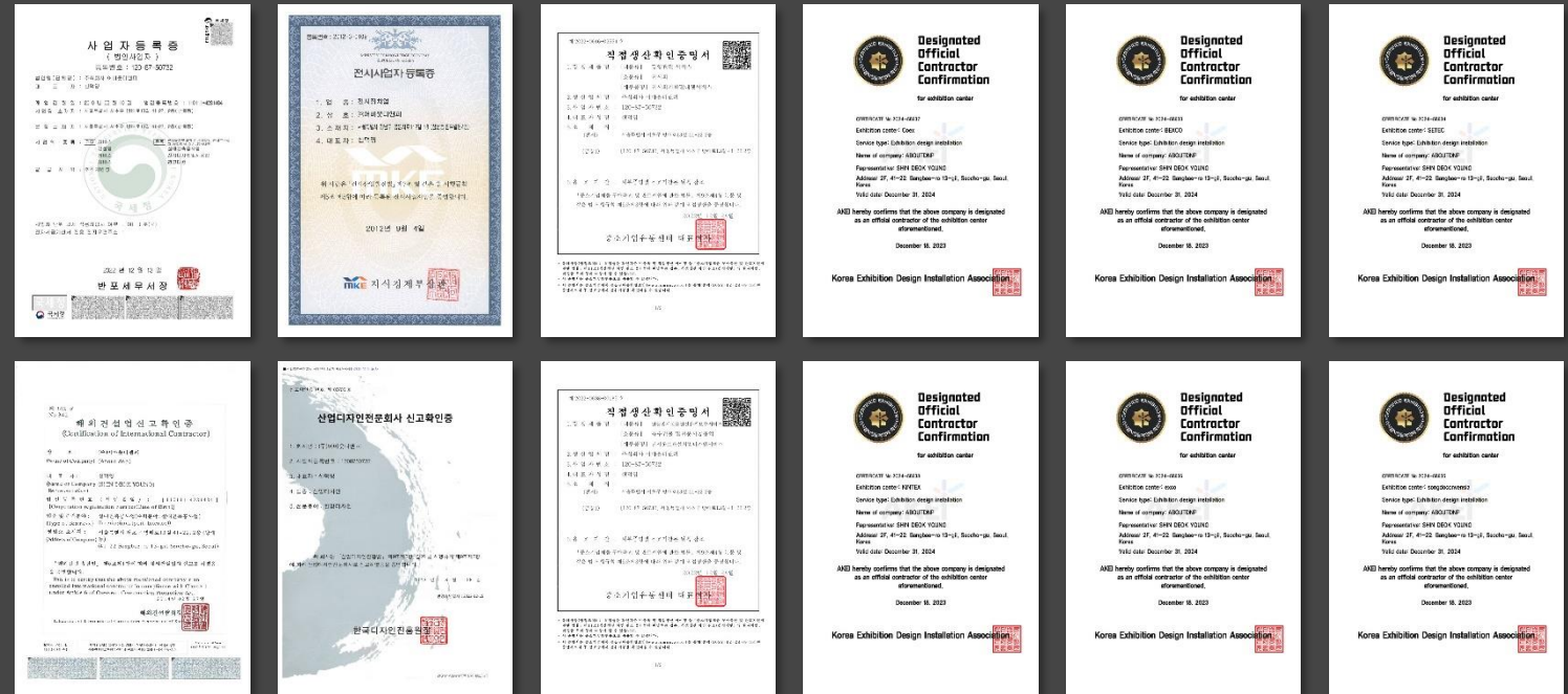
* 각종 면허 및 자격 취득으로 다양한 전시를 직접 수행 할 자격 보유