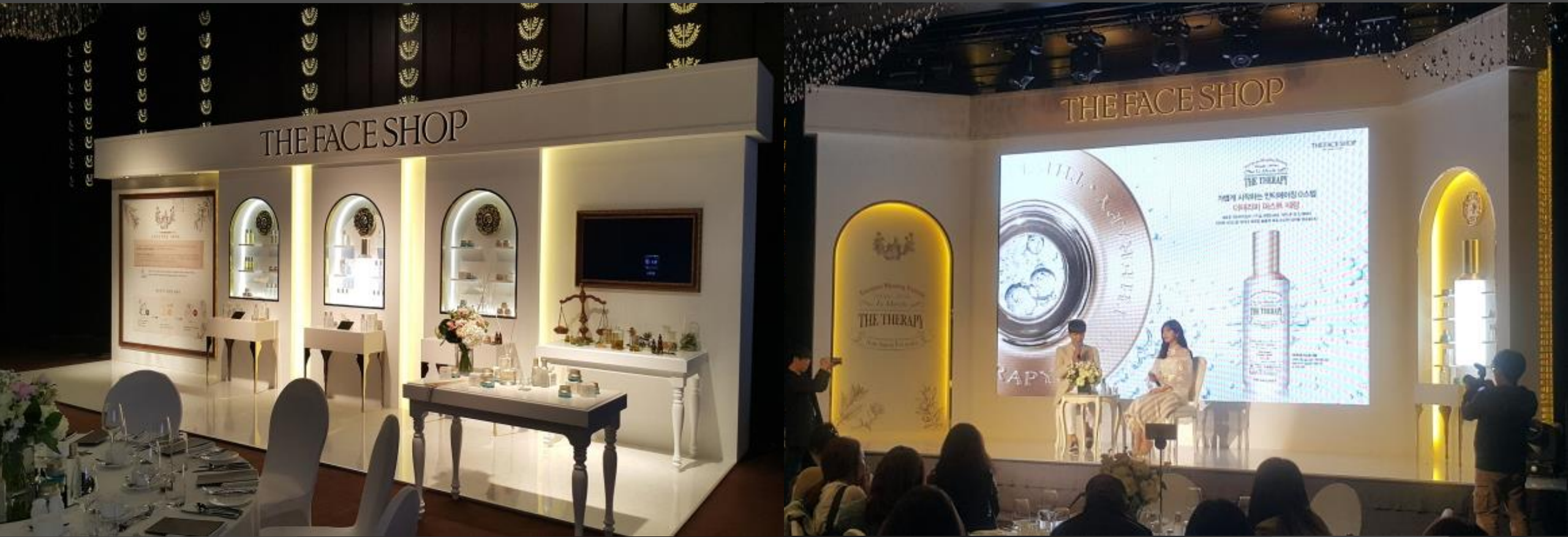
"THE FACE SHOP" BANYAN TREE (SEOUL, KOREA)