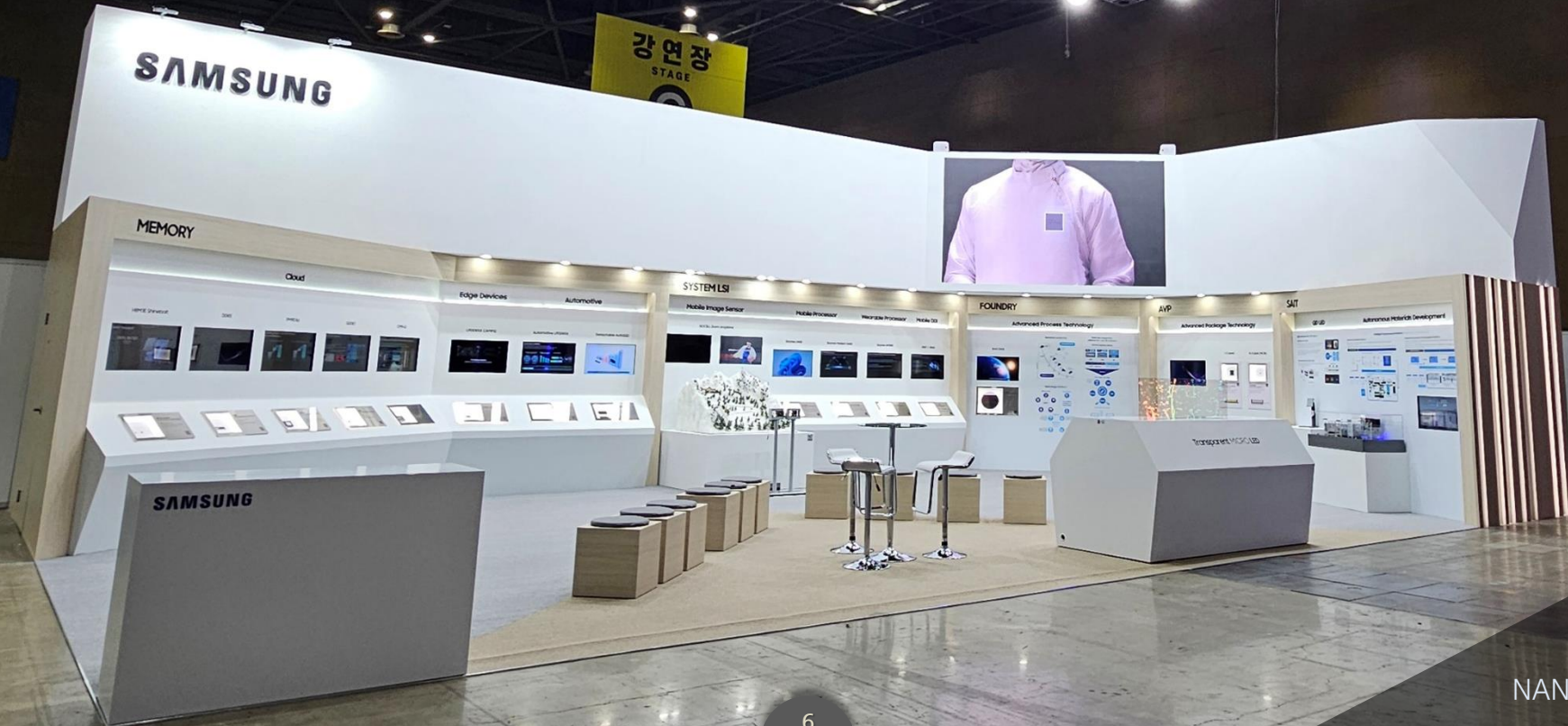
"SAMSUNG" NANO KOREA (KINTEX, KOREA)