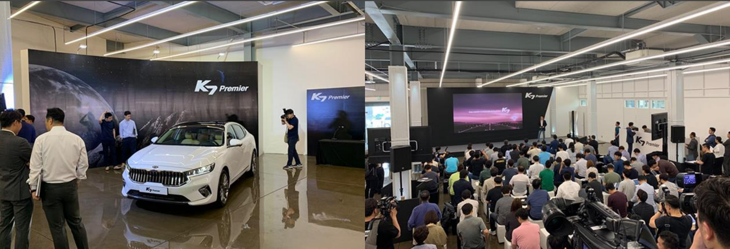
"K7 Launching Show" KIA (SEOUL, KOREA)