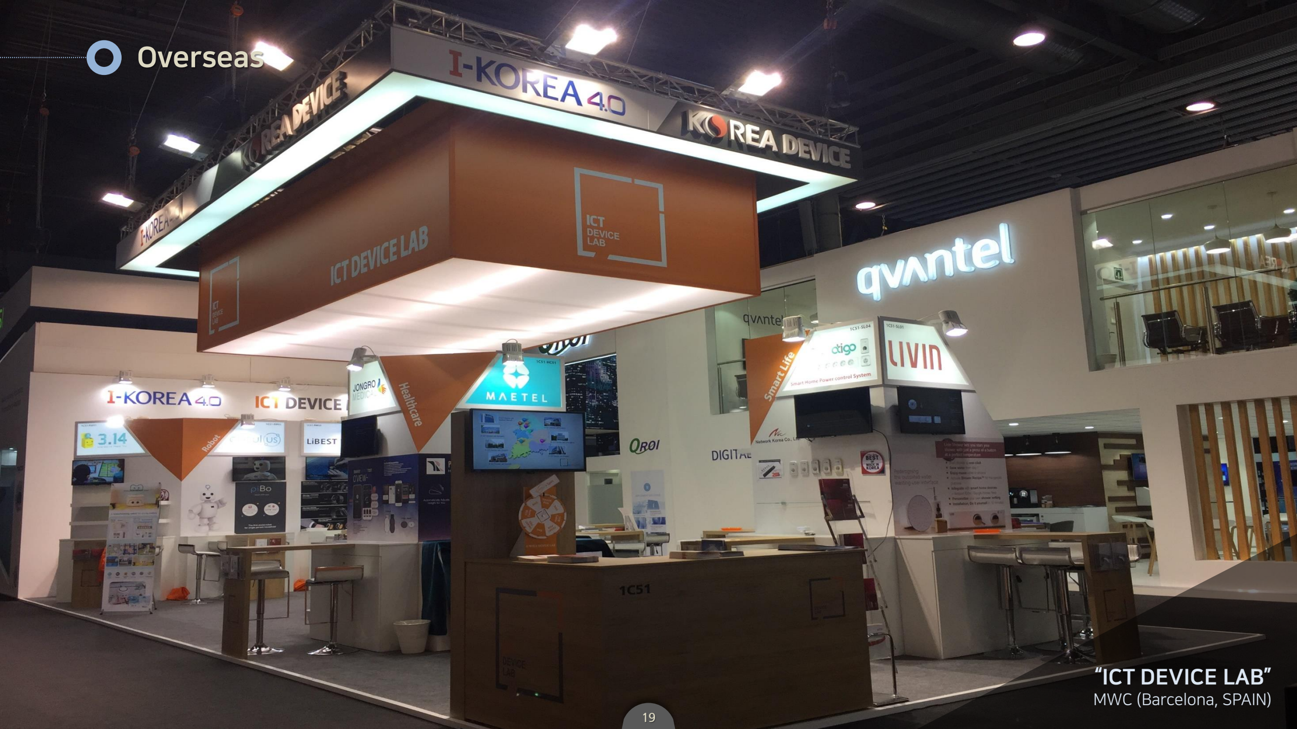
"ICT DEVICE LAB" MWC (Barcelona, SPAIN)