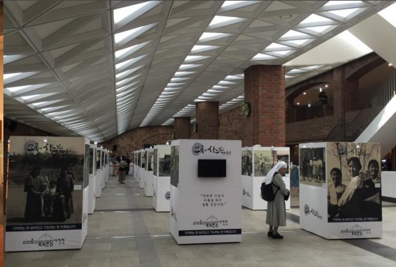
"Seoul History" (SEOUL, KOREA)