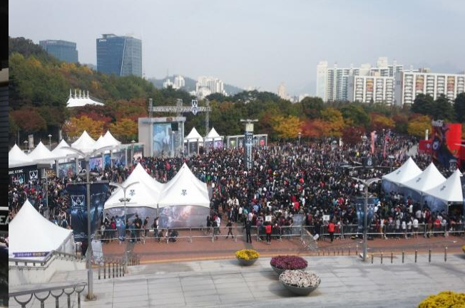
“LOL World Championship” (Tour, KOREA)