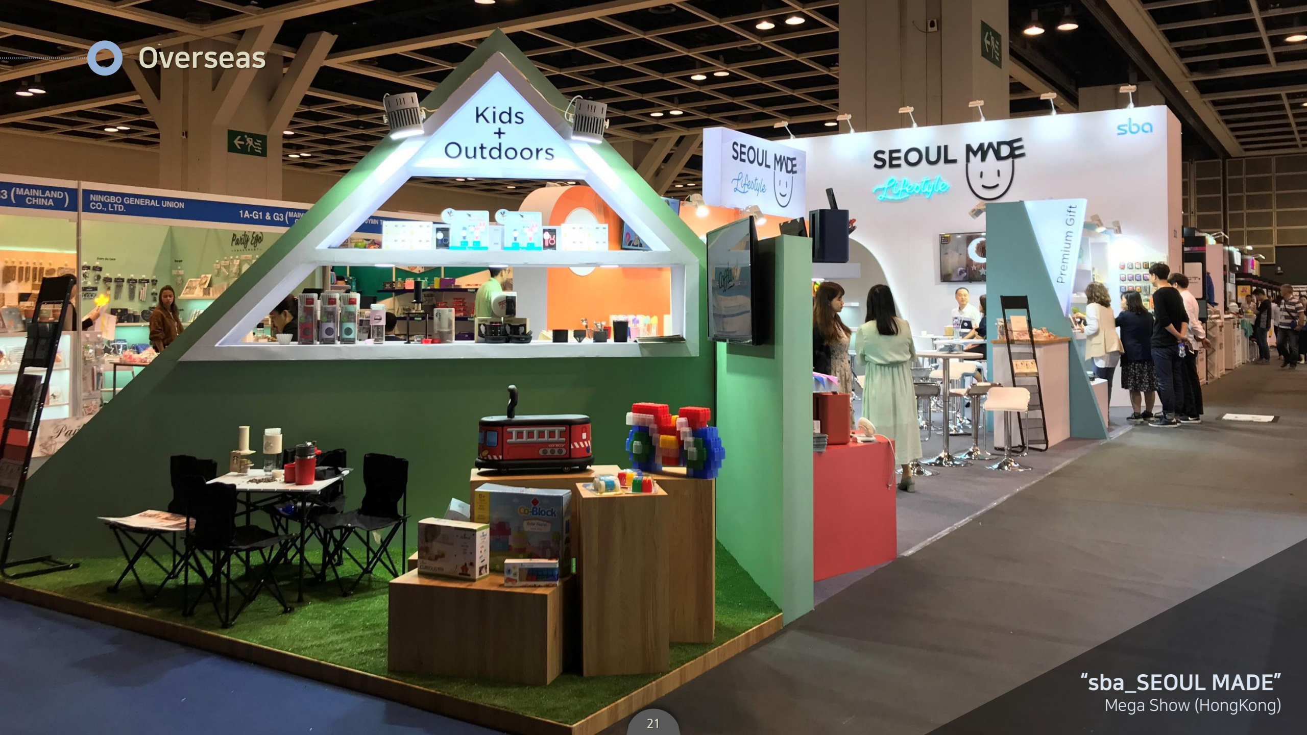
"sba_SEOUL MADE" Mega Show (HongKong)