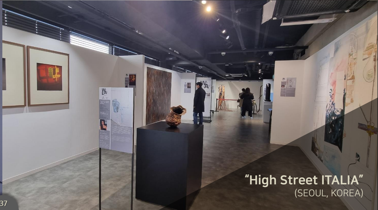
"High Street ITALIA" (SEOUL, KOREA)